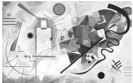
Fig. 2. Kandinsky's Yellow-Red-Blue (1925) is from his period of totally non-representational works, but this particular painting seems evocative of the concept of a person experiencing vivid 'synesthetic' imagery. Oil on canvas, Musée National d'Art Moderne, Centre Georges Pompidou.

One painter who explored synesthesia extensively was Vassily Kandinsky (1866–1944), who had striven to enhance his cross-modal capabilities from childhood. His writings make a strong case that he was a true synesthete (Ione & Tyler, 2003). Stimulated to develop a sensory unification of color and music, Kandinsky systematically devised dynamic painted compositions (see Fig. 2) that are difficult to perceive in terms of static representation. Rather the concrete painted forms evoke a visceral language that entices the